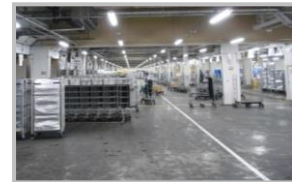
Factory / Warehouse